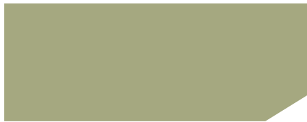
RR 08 Cascade Green SW 0066