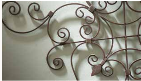
Wallcoverings shown: 1. pattern # 441-5564 2. pattern # 441-5595 3. pattern # 441-5561