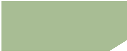
RR 01 Majolica Green SW 0013