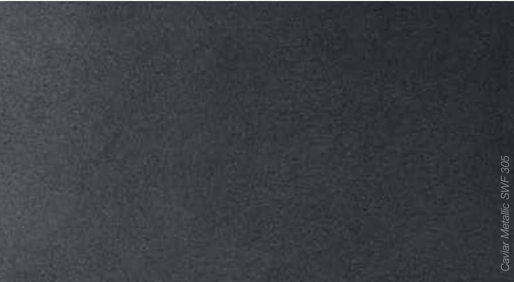
Caviar Metallic SWF 305