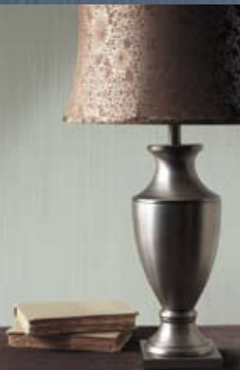
Oyster Bay Quartz Stone SWF 264

Watch a step-by-step video of these application techniques at sherwin-williams.com/faux .