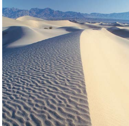
Distance Quartz Stone SWF 263

This technique features a one-two punch of pizzazz by using a metallic undercoating in conjunction with the shimmering highlights of Quartz Stone. The traditional striae application brings out the glamour to create a real knockout look. Try it in your guest room or wine cellar.