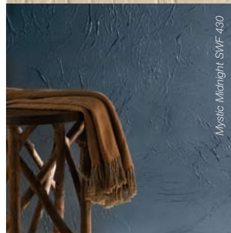
Mystic Midnight SWF 430

Watch a step-by-step video of these application techniques at sherwin-williams.com/faux .