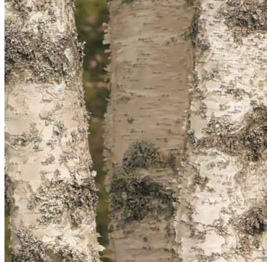
Champagne Freeze SWF 425

Irregular creases and folds created in this technique provide the opportunity to add outstanding interest to any plain surface you'd like to highlight. From afar, the texture is subtle—taking on an appearance of stucco or cement. As you get closer, the unusual personality of the wall emerges as a delightful surprise.