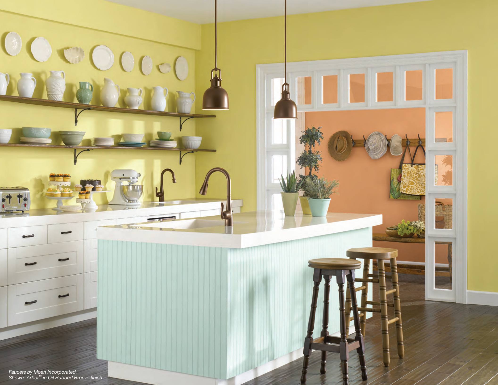
Faucets by Moen Incorporated. Shown: Arbor™ in Oil Rubbed Bronze finish.