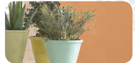
SW 7743 Mountain Road