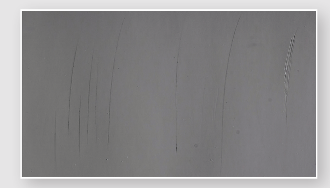
Scuff Tuff® Interior Waterbased Enamel