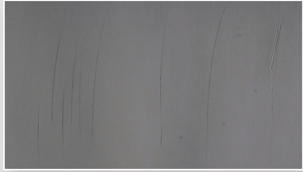
Leading National Competitor

Scuff Tuff™ Interior Waterbased Enamel delivers a super-durable, scuff-resistant finish without compromising on appearance.