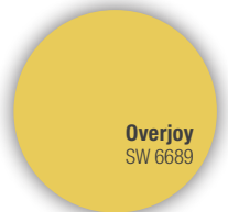
Overjoy SW 6689

SIGNATURE SIGNATURE SIGNATURE SHADE SIGNATURE SIGNATURE