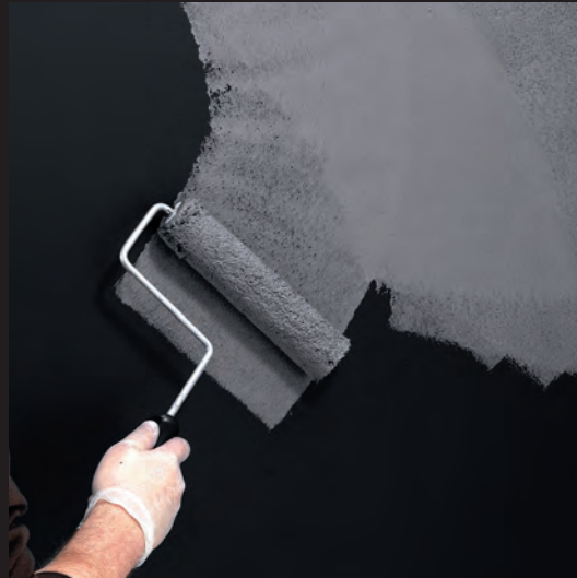
Caviar Metallic SWF 305