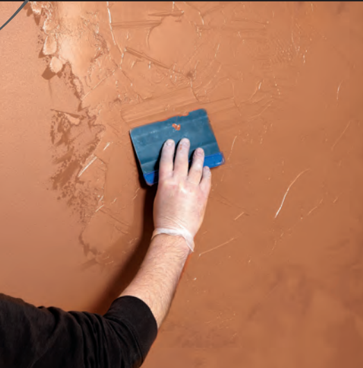
Copper Gleam SWF 129

*Without Sher-Clear 1K, Faux Impressions has the durability of satin latex paint. Ask your Sherwin-Williams rep for complete performance specifications.