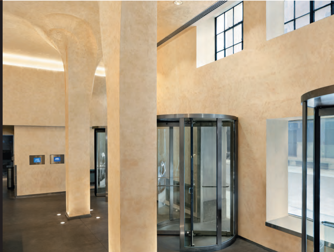
The Starrett-Lehigh Building, New York, New York