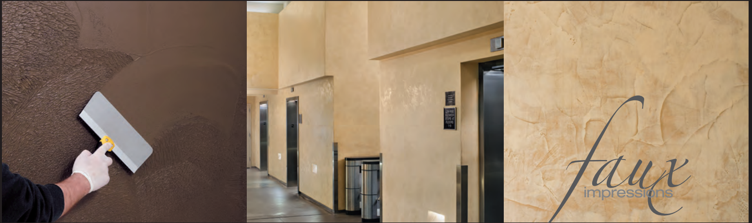
(above left) Well-Bred Brown Quartz Stone SWF 262 LOBBY (above center and right) High-Polish Fresco custom-matched to SW 6114 Bagel