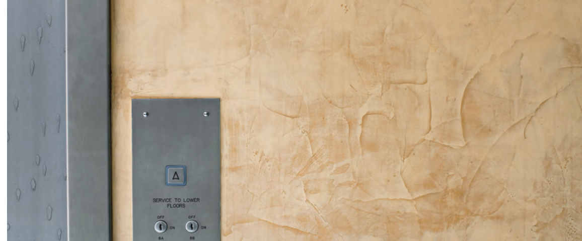
LOBBY (opposite, left & below) High-Polish Fresco custom-matched to SW 6114 Bagel