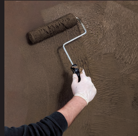
Well-Bred Brown Quartz Stone SWF 262