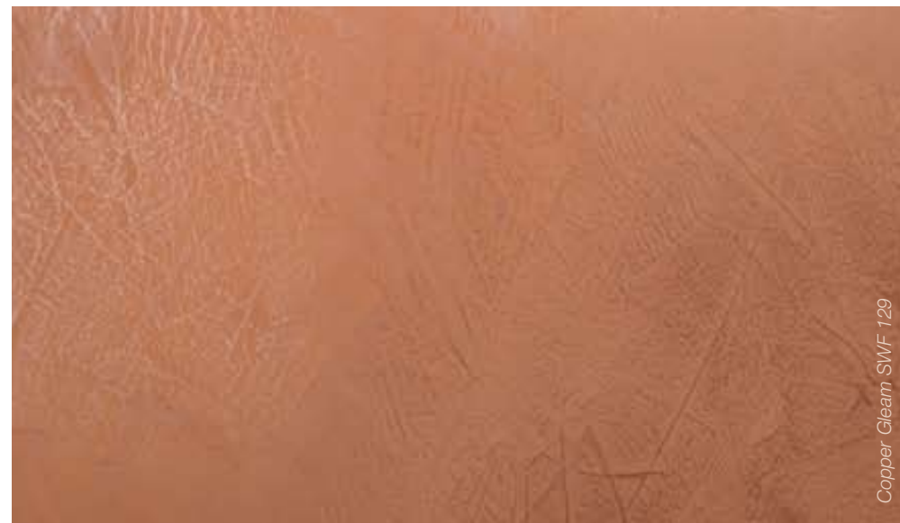
Copper Gleam SWF 129