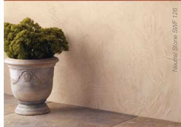
Neutral Stone SWF 126