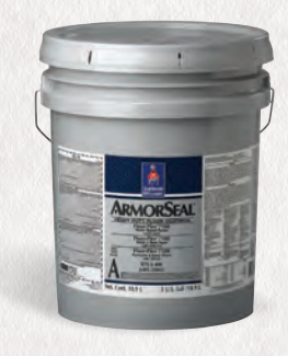
HEAVY DUTY FLOORS