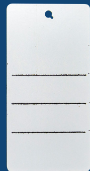
Competitor's leading product

Scratch test is done by an Elcometer®. Per Elcometer, "The Elcometer 3000 Motorised Clemen Unit is a robust and accurate instrument for evaluating the resistance to scratching of a coated surface. The sample can be metal, wood, glass, plastic or other hard materials." As tested by Sherwin-Williams ISO 9001 certified labs based on ASTM® standards, and other generally accepted industry standards, as applicable. All tests were done with semi-gloss paint.