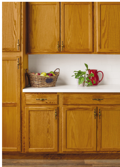
BEFORE Years of use and wear quickly age cabinet doors, and the current stain or paint color might have gone out of style.

Refinishing cabinetry is the quickest way to refresh a kitchen. Being skilled, knowledgeable and experienced in cabinet refinishing can be a huge competitive advantage. And transforming dated or worn-out cabinets can help make any space look completely new.