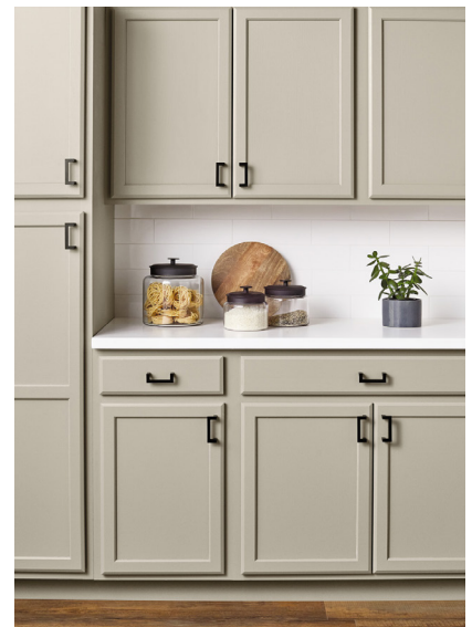
AFTER The refinished cabinets have a contemporary color that gives the kitchen a refreshed new look.