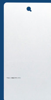
ProClassic® Interior Waterbased Acrylic-Alkyd