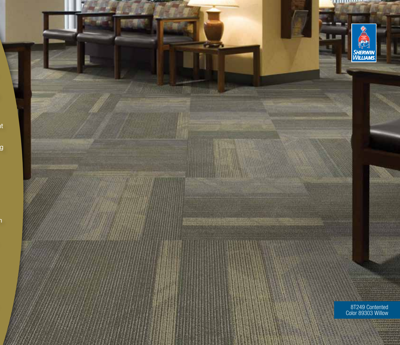
8T249 Contented Color 89303 Willow