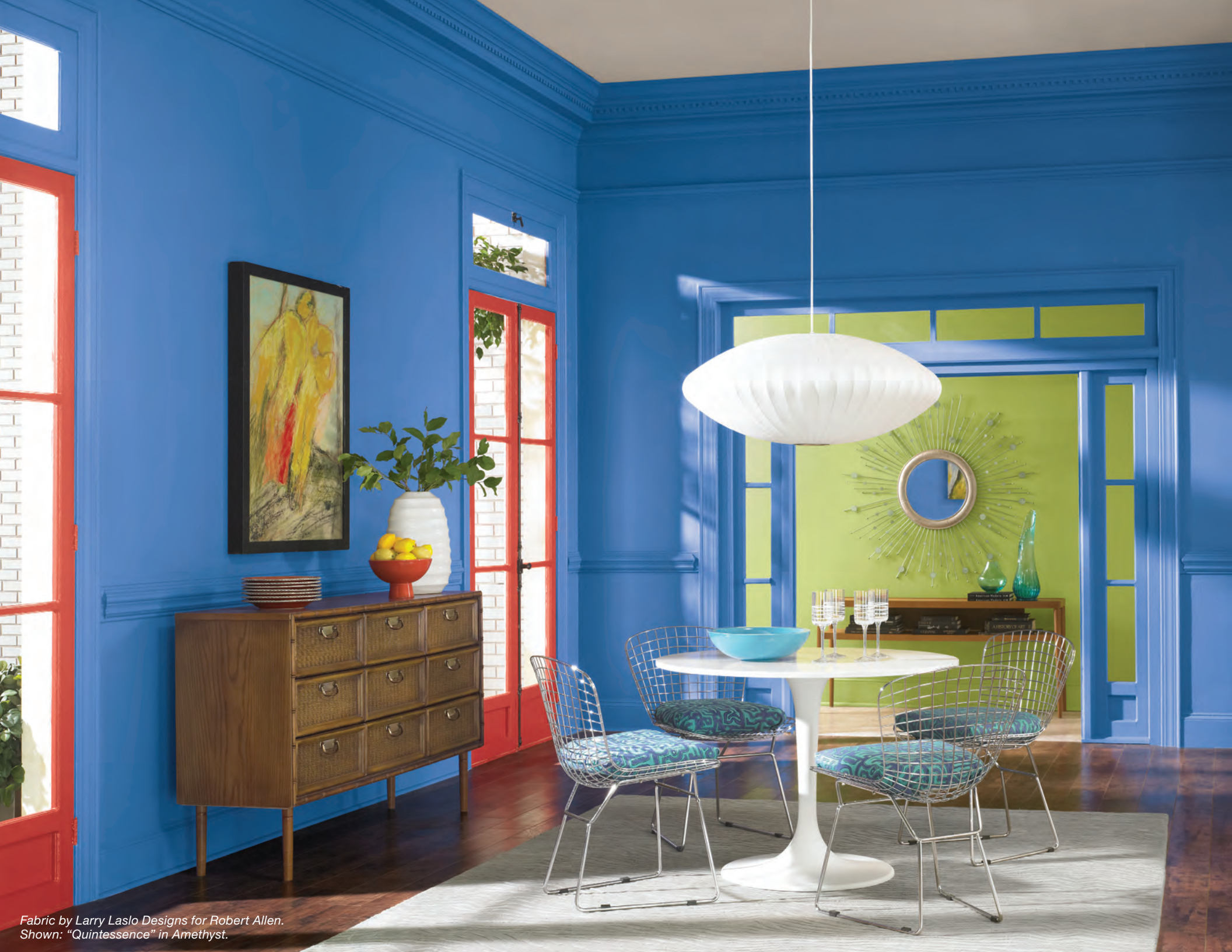
Fabric by Larry Laslo Designs for Robert Allen. Shown: "Quintessence" in Amethyst.